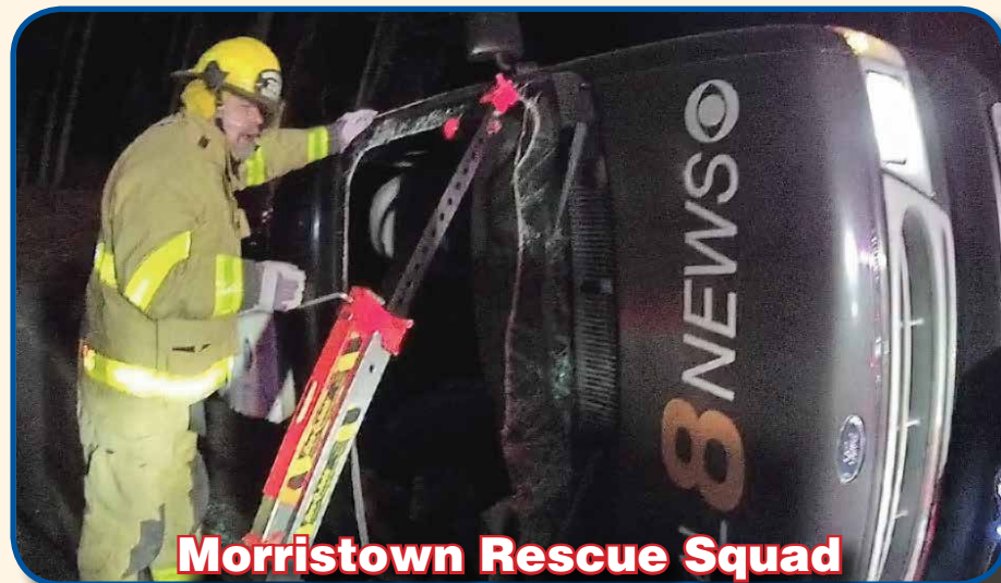
Morristown Rescue Squad

Senior Citizens Home Assistance provided 20,038 hours of caregiving which included light housekeeping, cooking, laundry, grocery shopping and companionship.