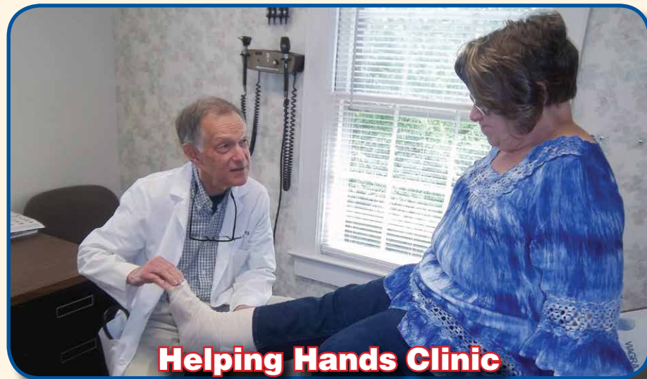
Helping Hands Clinic

At the Helping Hands Clinic , there were 2,020 visits of patients with no health insurance who fall within the 200% federal poverty guidelines.